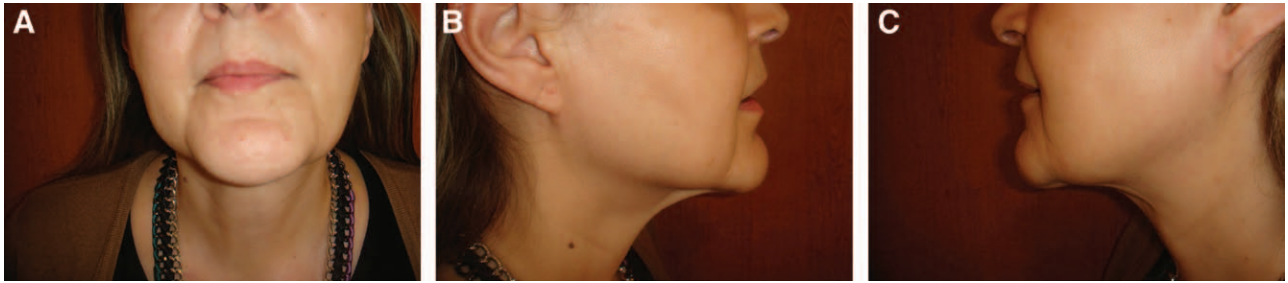
Fig. 4. Postoperative (1 year) pictures—case 1: front view (A), lateral right view (B), and lateral left view (C).