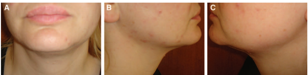
Fig. 7. Postoperative (1 year) pictures—case 2. Observe the remarkable improvement of the jowls: front view (A), lateral right view (B), and lateral left view (C).