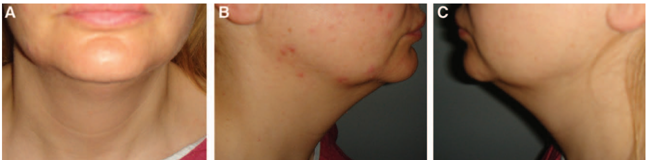
Fig. 6. Preoperative pictures—case 2: front view (A), lateral right view (B), and lateral left view (C).