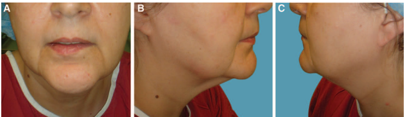
Fig. 3. Preoperative pictures—case 1: front view (A), lateral right view (B), and lateral left view (C).