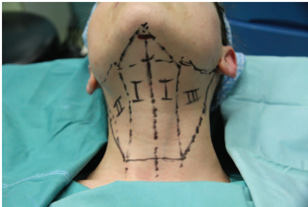
Fig. 2. Preoperative neck area design for treatment.

The RFAL delivers radiofrequency converted into heat, estimated in kilojoules. The mean amount of energy delivered was 4.5 kJ per procedure (2–8.5 kJ).